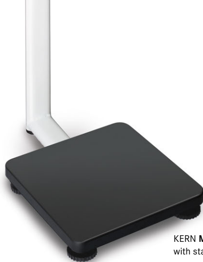
KERN MPS-PM with stand