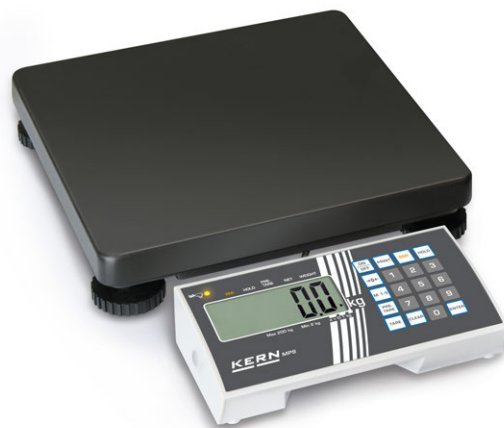
KERN MPS-M with free-standing display device